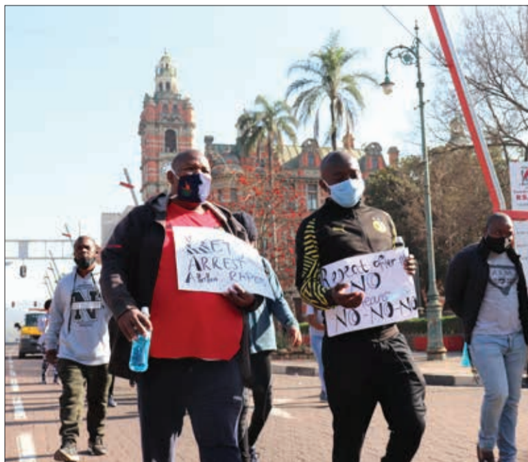
Walking against gender-based violence

She said it was a conscious decision to call it a gender-based