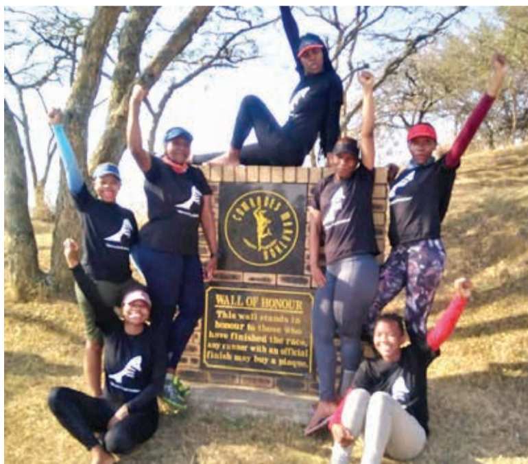
Participants in the Walkathon

safety of participants was prioritised throughout the route.