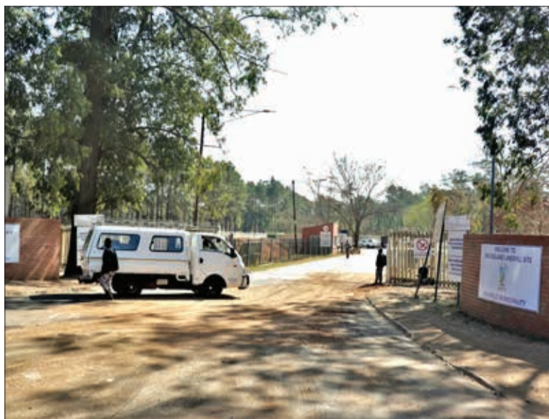
Entrance to the New England Road Landfill Site

He said as part of the solution, they followed the directive that was issued by the Department, which had to do with the regulation of the facility. The first being to check all the waste that is being brought into the landfill site to ensure that there is no hazardous material. Secondly, the staffers have to monitor the number of vehicles coming into the facility and the third measure is for the officials