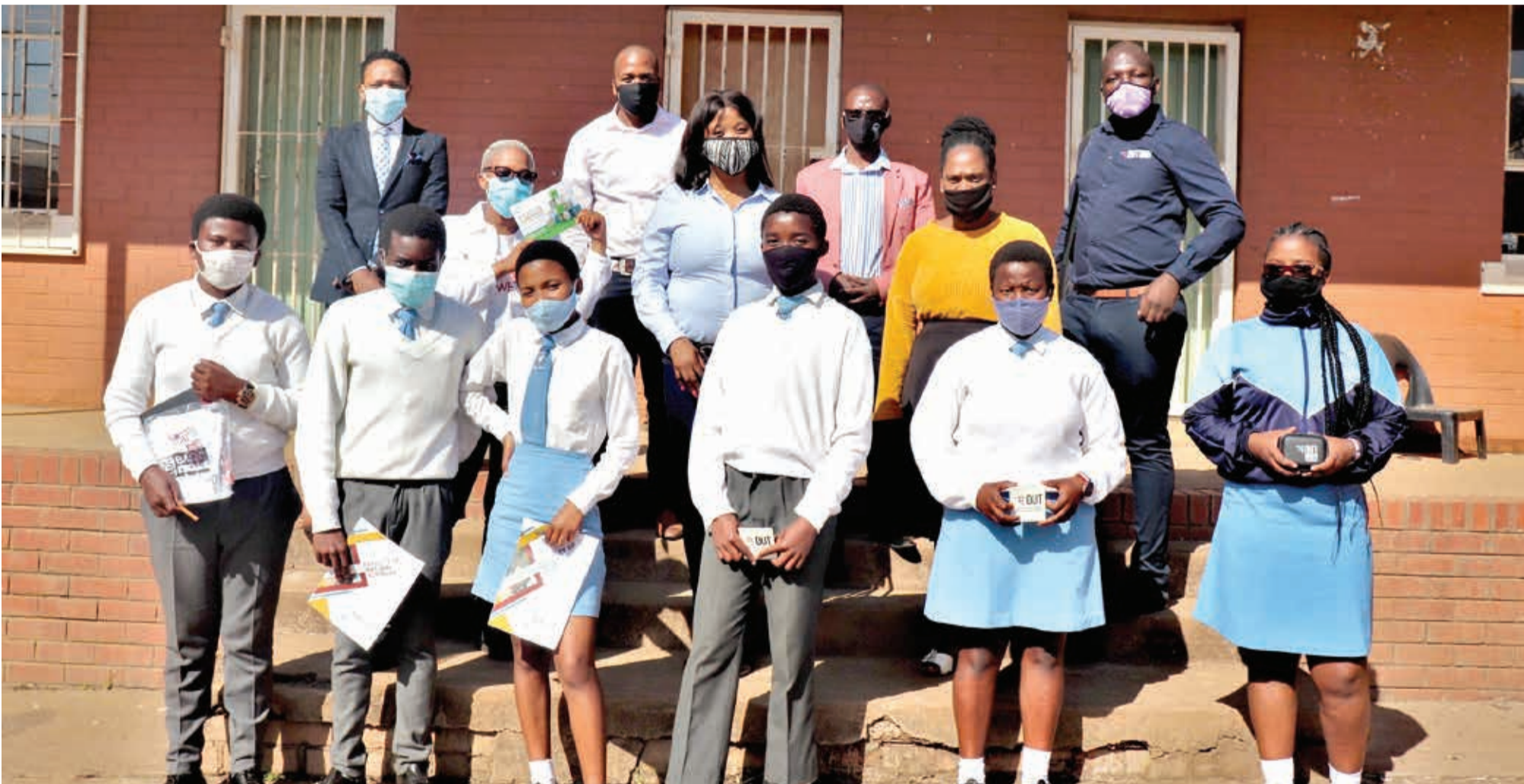
Pictured are students whose applications will be paid by benefactors together with officials from the Office of the Mayor.