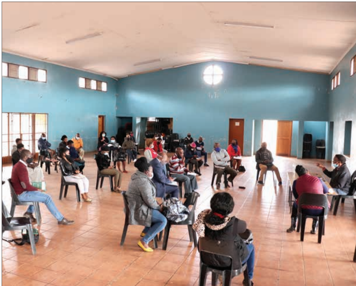
Meeting of the Local Task Team under Operation Sukuma Sakhe