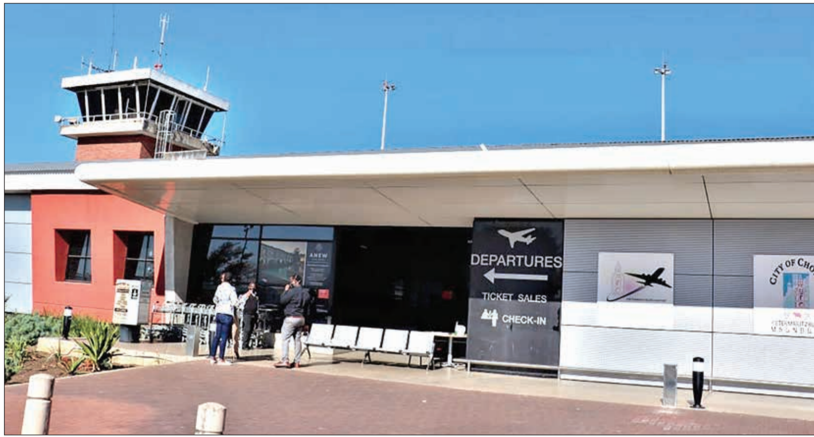
Oribi Airport which has passed stringent safety requirements

recklessness on their part could lead to a disaster which would adversely affect the local economy, safety of passengers and the lives of community members residing in the vicinity of the airport. Currently the airport has five departure flights and another five in-coming flights daily.