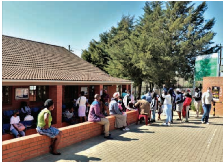
Community members at the Mafakatini Clinic

“The other issue is funerals because in this area residents still come out in large numbers when one of their neighbours die. Also many still don’t think it’s critical for them to wear masks when they travel by taxi or to adhere to social distancing